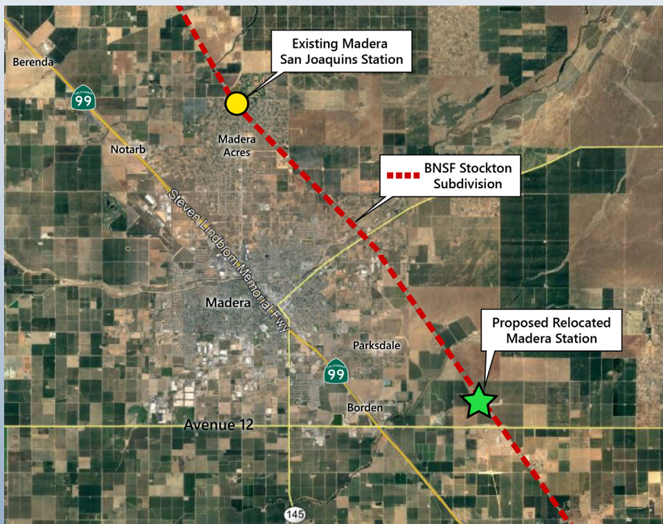
Figure 2. Current and Proposed Relocated Madera Station