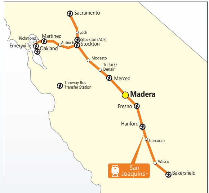
Figure 1. Current San Joaquins Route Map

SJJPA is responsible for the management of the San Joaquins rail service and is the CEQA lead agency for this effort. To help ensure a successful process, the SJJPA is working closely with the Madera County Transportation Commission, Madera County, City of Madera, California State Transportation Agency (CalSTA), and the California High-Speed Rail Authority (CHSRA).